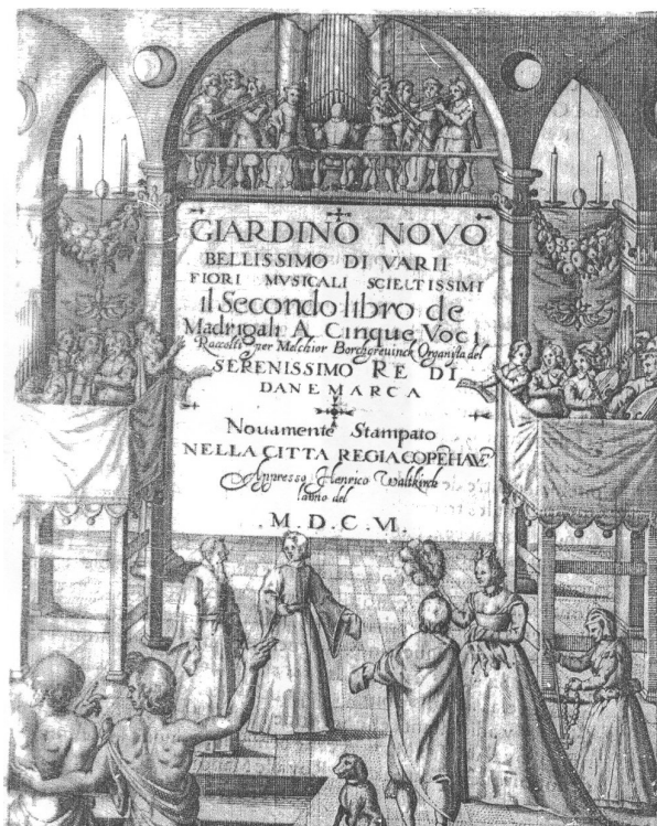
From the madrigal anthology Giardino Novo, published in Copenhagen 1606